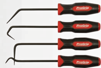
13096 4 PC PROGRIP HOSE PICK SET