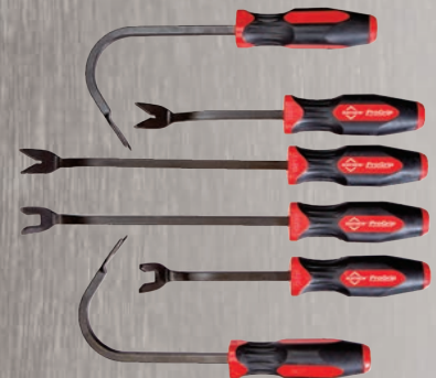
13078 6 Pc PROGRIP Trim Tool Set