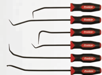
13097 6 PC PROGRIP HOSE PICK SET