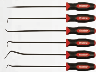
13095 6 PC PROGRIP LONG PICK SET