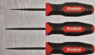
13093 3 PC PROGRIP MARKING & HOLE MAKING SET