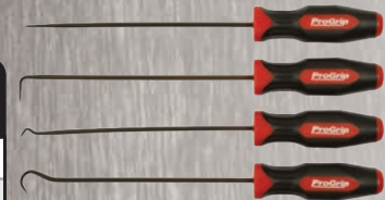
13091 4 PC PROGRIP MINIATURE LONG PICK SET