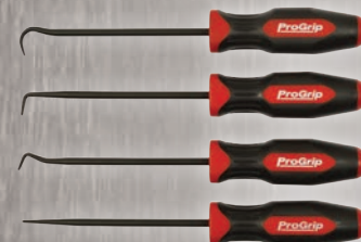
13094 4 PC PROGRIP HOOK & PICK SET