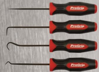
13090 4 PC PROGRIP MINIATURE PICK SET