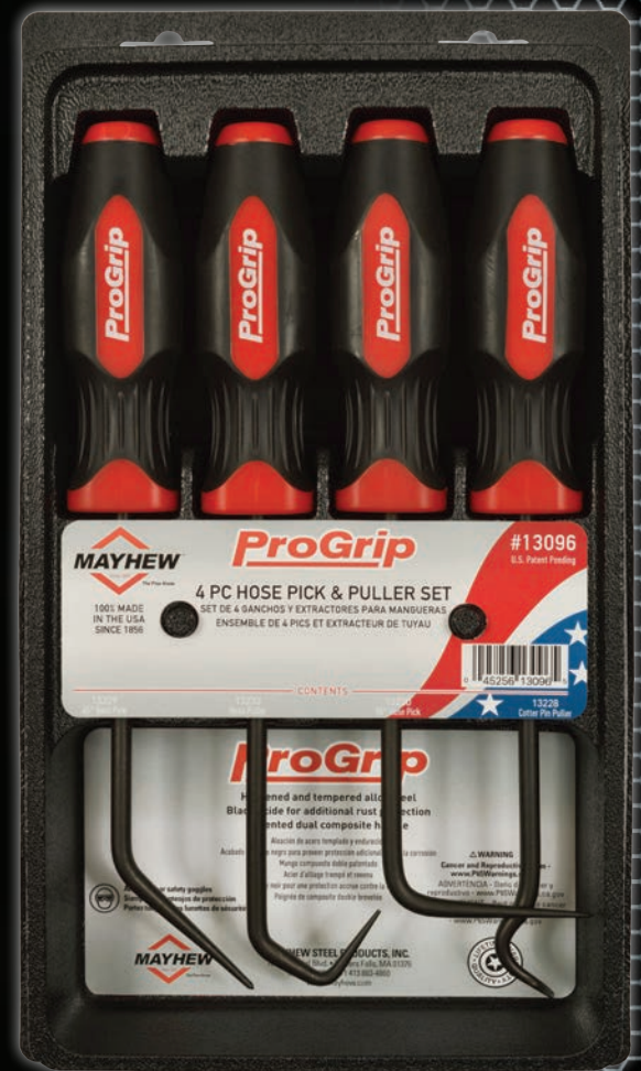
13096 - 4 Pc PROGRIP Hose Pick Set