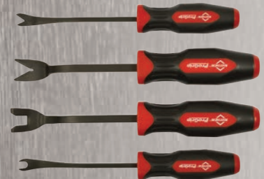
13077 4 Pc PROGRIP Trim Tool Set