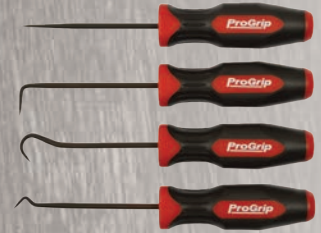
13090 4 Pc PROGRIP Miniature Pick Set