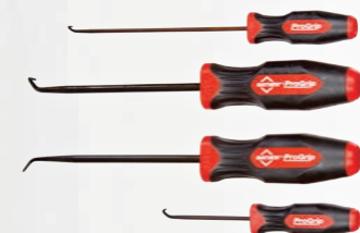
13098 4 PC PROGRIP O-RING REMOVAL SET